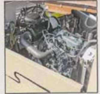
25hp Kubota Diesel engine