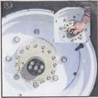
Push button lockout hubs