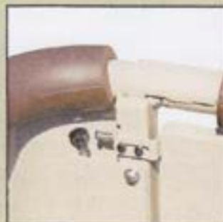
Door safety latch