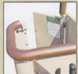
Easy Access Door

Prune-Rite 1318 N. Dakota Ave. • Modesto, CA 95358 • Ph. 209.521.9825 • Fax 209.521.8810 www.prune-rite.com