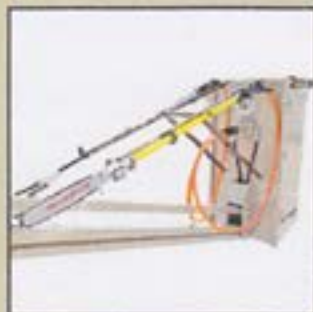
Folding tool mount