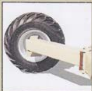
Axle extension (25' model)