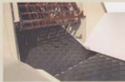
Dual Belt System (30" Horizontal belt / 36" incline belt) allows the operator to control the belt speed for faster unloading, less plugging and minimal spilling.