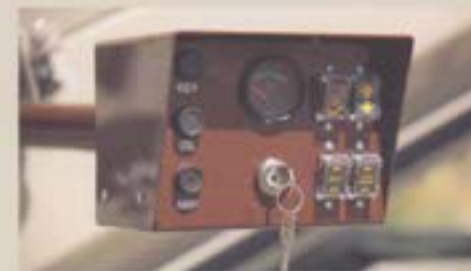
Swing out pod with push button controls for operator convenience and simplicity (never have to leave your seat) (Remote control optional)