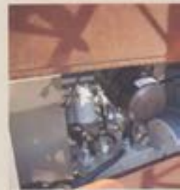
Powerful Deutz air-cooled turbo diesel engine (69 HP)