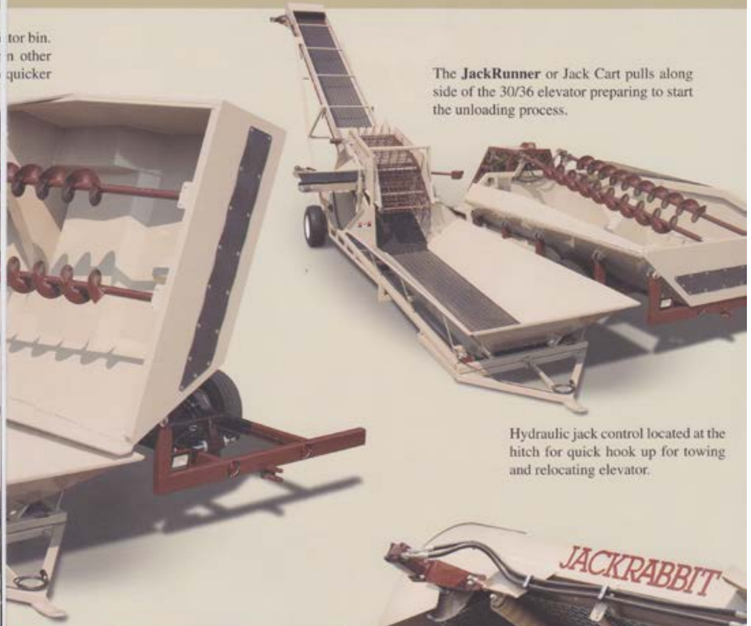
The JackRunner or Jack Cart pulls along side of the 30/36 elevator preparing to start the unloading process.