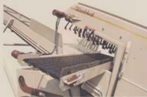
The Woodchuck Desticker stick belt removes the sticks away from the elevator and out of the orchard.

The Woodchuck Desticker removes more sticks for cleaner loads than any other type of desticking method. Trailers loaded with nuts and minimal sticks equals a more profitable load as it arrives to the huller or processor. Sticks are removed at the elevator not in the orchard to eliminate time and labor. The Woodchuck desticker is hydraulically actuated and can be raised with a push of a button for young orchards that typically don't have a stick problem. Desticker chain configurations are available for Almonds, Walnuts, and Pecans.