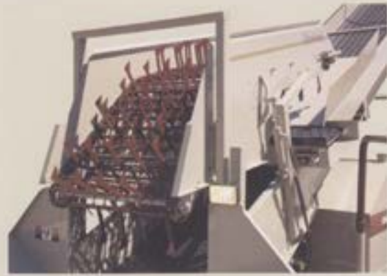
JackRabbit Woodchuck Desticker option

Real thinking, creative engineering, and craftsmanship produces the fastest speed you need for cleaner, more profitable delivery!