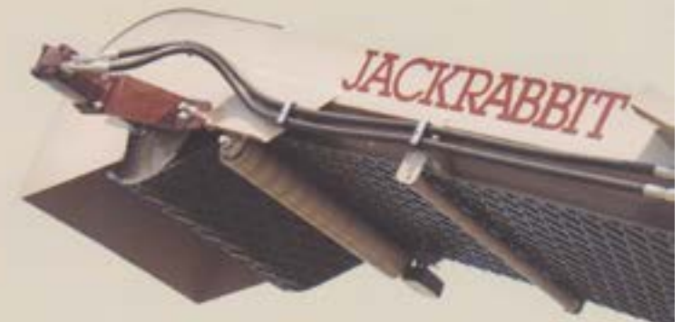
The 36" wide incline belt moves product fast and gentle.