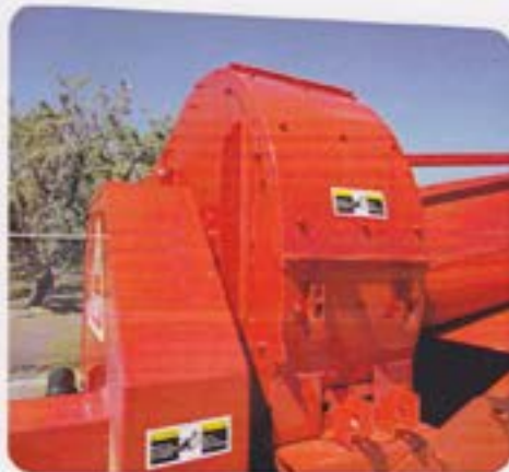
Low Velocity, High Capacity Fan with Hinged Cover and other Hinged Shields for Easy Access