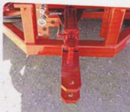
Hydraulic Adjustable Hitch - Standard